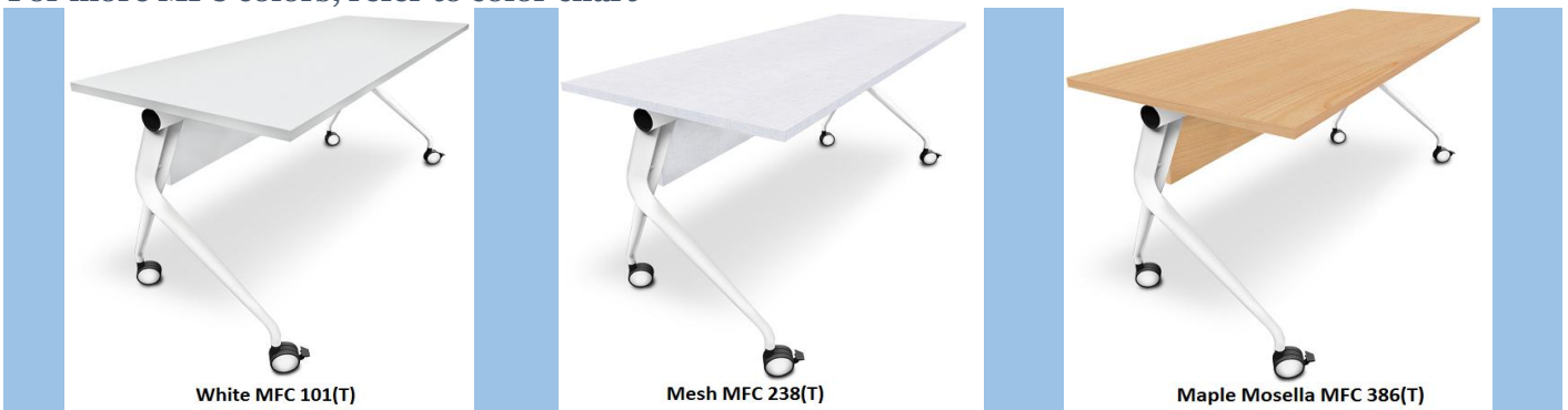
White MFC 101(T)

For more MFC colors, refer to color chart